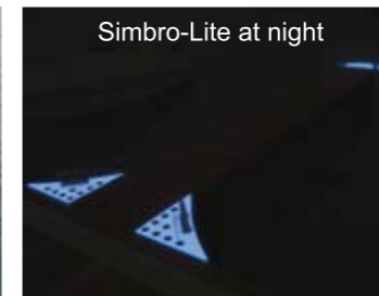
Simbro-Lite at night