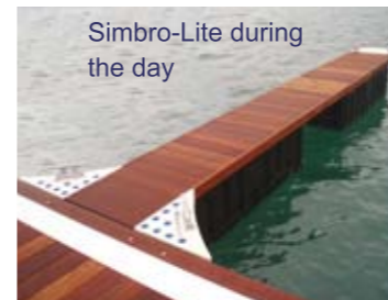
Simbro-Lite during the day